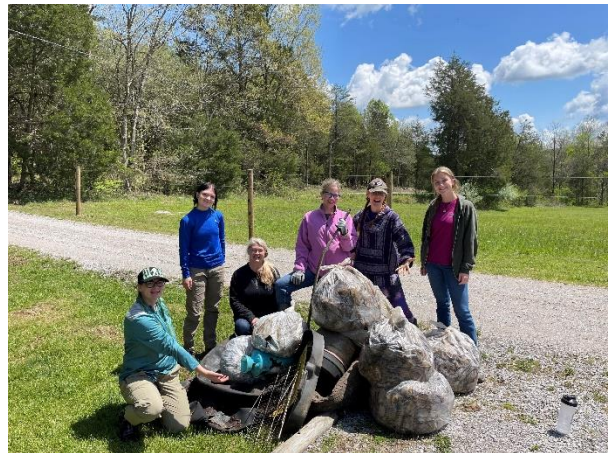
The "fruit" of our labor