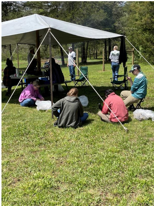
Waiting for lunch on a perfect day!