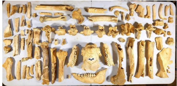
The Beach family has donated a number of fossils to the Gray Fossil Site and Museum, including these elk bones and a giant ground sloth tooth!

The caves have always been on family property, some eventually willed to me, my sister and my uncle.