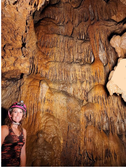
A visitor poses in front of the impressive "Wax Wall."