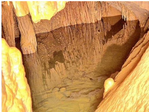
There are 10 caves within walking distance of the Beach's Nest. As they have been in the family for years, you can see they are in pristine condition.

When were you first drawn to caving? I grew up in what is now known as the Beach's Nest. We were drawn to the caves as kids. The mystery, the unknown, the formations. It was like entering another world. I am a bit of a nerd, so for a time I was in and out of caving and into other hobbies.