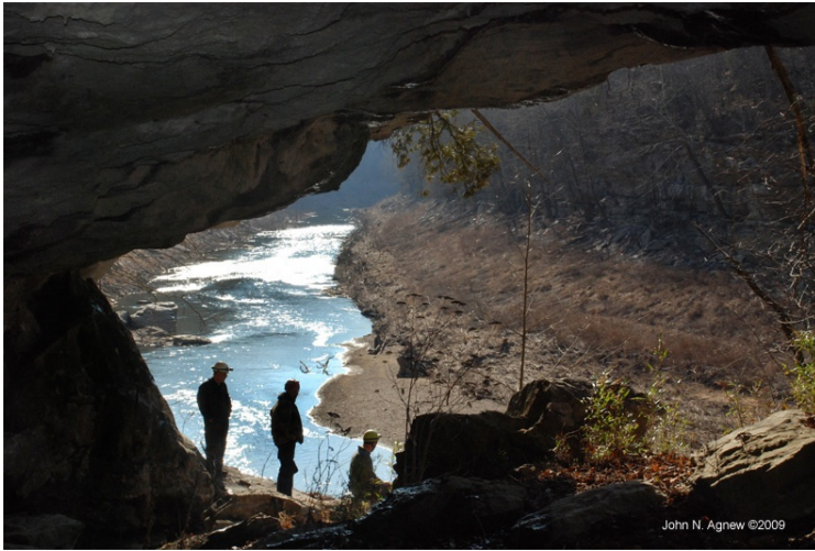
Rabid Fish Cave Entrance overlooking Buck Creek

Pulaski County, Kentucky February 16, 2009