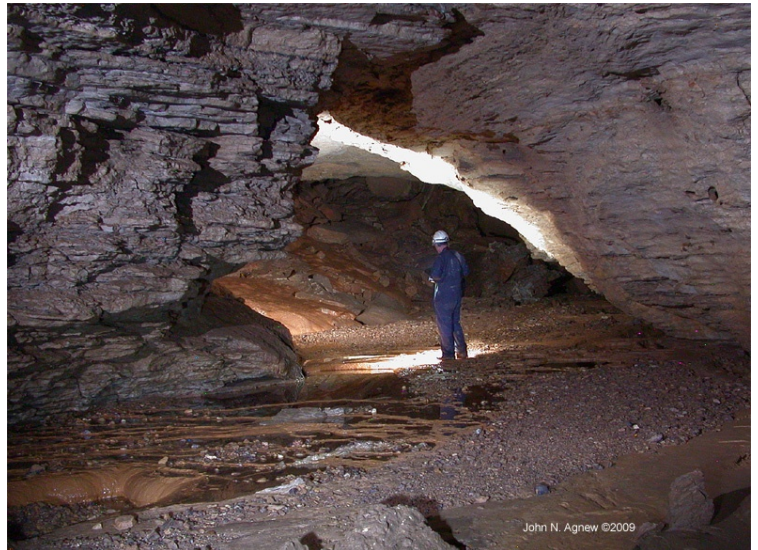
Rimstone in Rabid Fish Cave