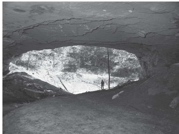
Neelys Lower Cave Looking Out

The genie paused for a minute and said, "Do ya think you could be happy with a two-lane bridge to Europe?"