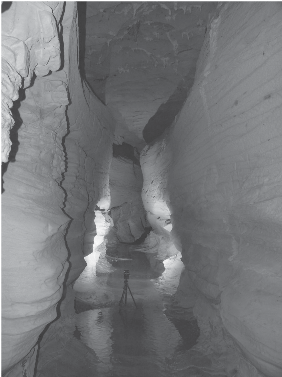
Neelys Creek Lower Cave Entrance Passage