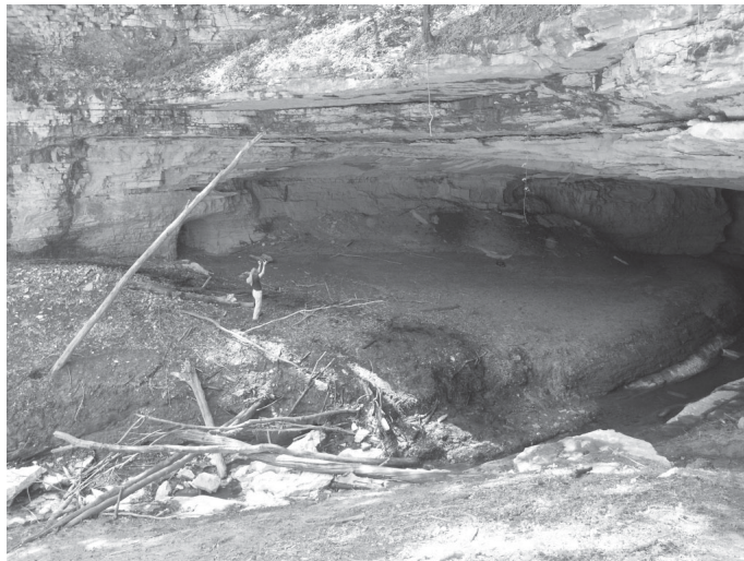
Lower Cave Entrance from Rim