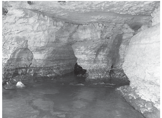
Middle Cave Resurgence

The lake cave is blocked at both ends. I am hoping that the area receives a BIG rain to clear the upper entrance and that the Corps of Engineers will lower Lake Cumberland enough this autumn to enter the river entrance of the lake cave. It should be very interesting if the Corps does lower the lake another 30 feet!