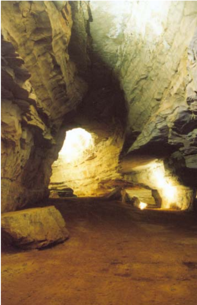
Looking toward Echo Auditorium in Great Saltpetre Cave