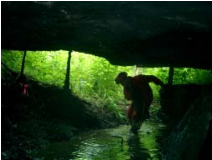
Cave Entrance in Sinking Valley

1989: Great Saltpetre Preserve is formed.